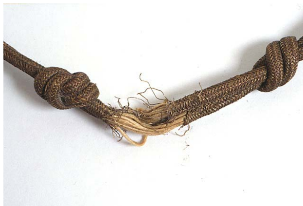
Figure 5. Sword knot showing loss in metal threads due to abrasion and stress during use and handling.

The overall condition of the sword and scabbard was stable and good. There was generalized tarnish on the brass and nickel-plated components. The sword knot, however, was in poor and unstable condition. The metallic threads were broken in five areas on one of the strands of the cord, and the interior cotton warps were exposed. The acorn was completely missing from the end of the cords. The existing bullion cordage is darkened from abrasion and soiling.