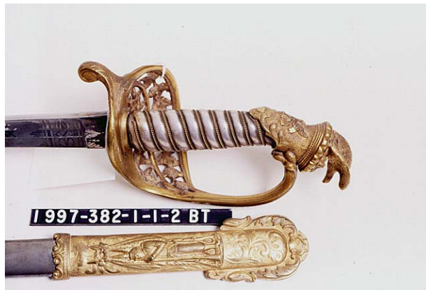
Figure 3. Detail of the pommel and hilt.

The brass eagle pommel cap is fitted to a nickel silver handle wrapped with brass wire.