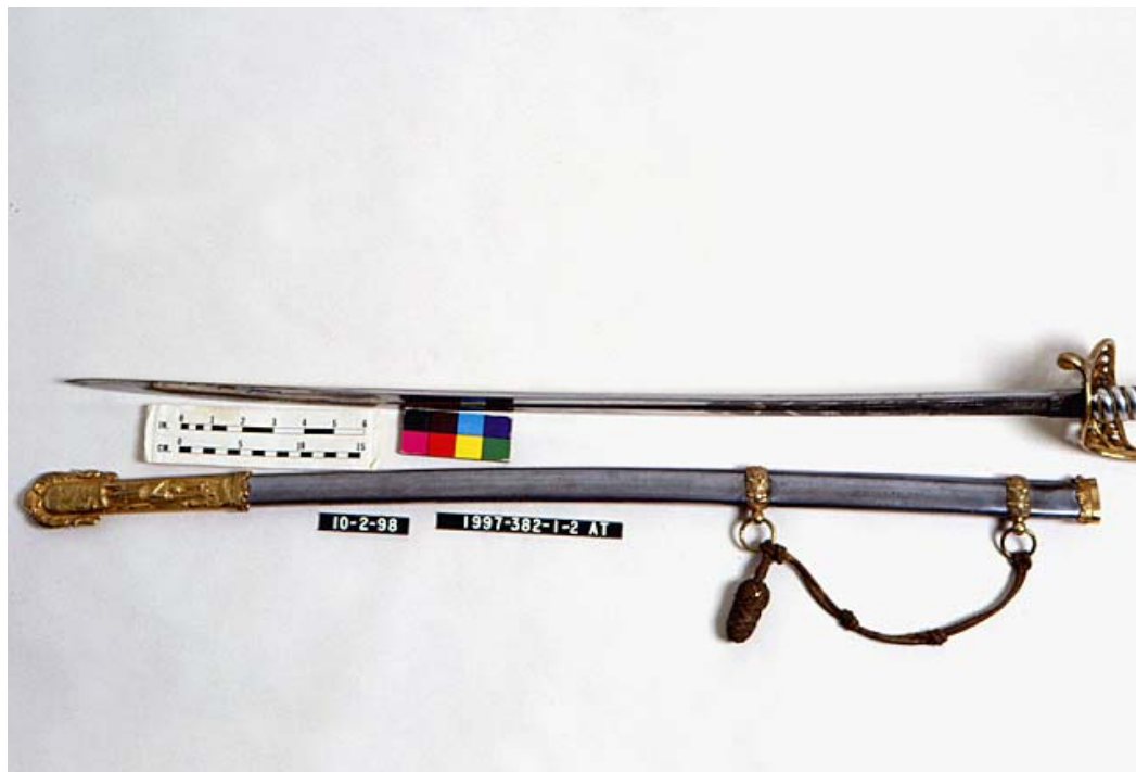
Figure 10. Sword and Scabbard after treatment.

The metal components were degreased with acetone to remove fingerprint residues and other oil-based dirt. Acidified thiourea solution was used to reduce and remove tarnish. The parts were rinsed with deionized water and polished with aluminum oxide paste. The polish residue was removed with acetone. The copper alloy parts were coated with 3% v/v Inctalac in toluene to retard future tarnish accumulation. The steel components were coated with 3% Acryloid B48N, v/v, for the same reason.